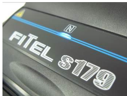
NFC: Lock and Unlock