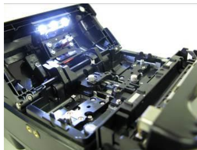
Illumination lamp: 3+1 LED