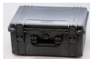
Hard Carrying Case