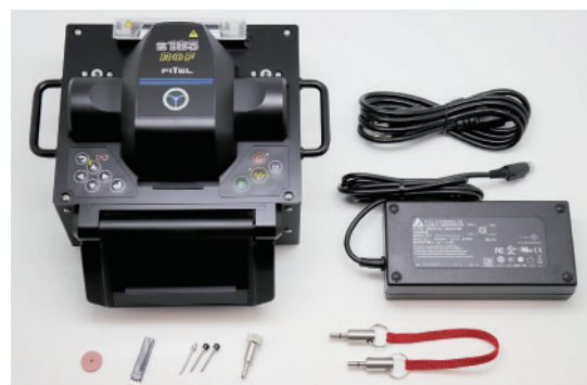
Standard Package (S185ROF)