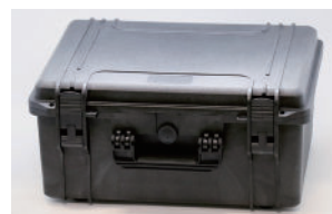
Hard Carrying Case