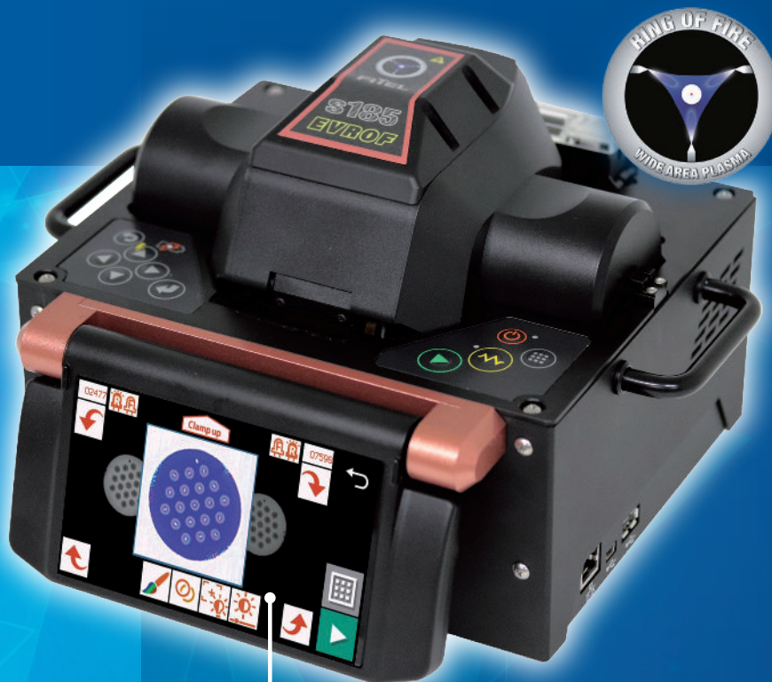
World's first Composite Image Technology - both fiber images overlapped for precise alignment

Best-in-class, compact and portable solution for hollow-core and multi-core fibers