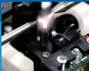
Three electrode Ring of Fire™ arc-discharging and STA²D™